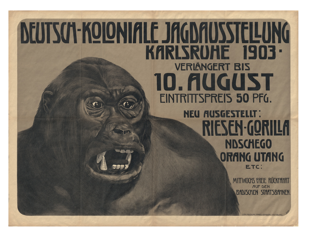
A poster printed by Friedländer in Hamburg for the 1903 German Colonial Hunting Exhibition in Karlsruhe — to advertise Umlauff's primate taxidermies.

So, while Zenker did not believe that the dermoplastic taxidermy had appropriately captured the gorilla's 'savagery', its parameters – staring eyes, jaws open wide, bared teeth – were reproduced in a poster that Umlauff had reprinted for the Karlsruhe exhibition – presumably to increase sales – but which probably did not reach Zenker in Cameroon. The posters displayed the head and shoulders of the gorilla, including dramatic facial expressions, next to the wording 'New exhibit'.